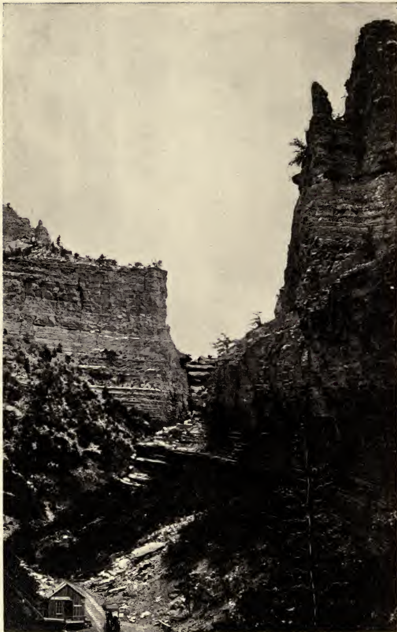
WILLIAMS CANON THE AMPHITHEATRE